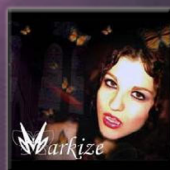
POUSSIÈRES DE VIE (DÉMO) 2004