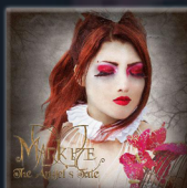
ANGELS' TALE (SINGLE) EDENRECORD/ UNDERCLASS 2010