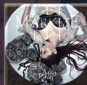
A PERFECT LIE (ALBUM) EDENRECORD 2012