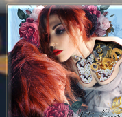
WHITE ROOM (SINGLE) ALINALYSROD 2022