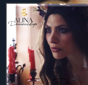
JE TE RENDS TON AMOUR (SINGLE) ALINALYSROD 2022