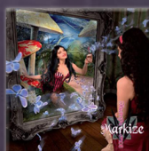
TRANSPARENCE EDENRECORD /UNDERCLASS 2007